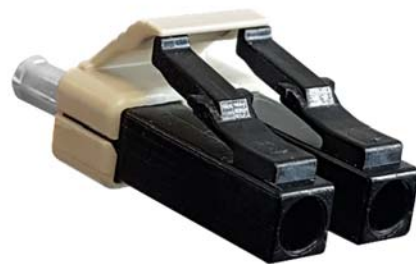
Table 1 ORDERING INFORMATION / PART NUMBERS

Firecomms LC plugs can be assembled easily onto a plastic optical fiber (POF) duplex cable to prepare it for use with Firecomms LC transceivers. The LC system offers a compact termination ideal for applications requiring robust plug retention and endurance against vibrations and mechanical shock.